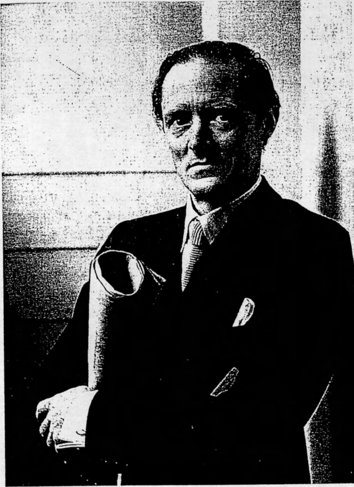
2. Photograph of Hugh Casson

of “the creative set.” Indeed, the 1940s and 1950s seems a reasonable time for a self-proclaimed traditional modernist. Anything earlier would have been too radical (and possibly too European or too “German”) and anything later would have forced the architect into the uncomfortable world of the late 1960s.