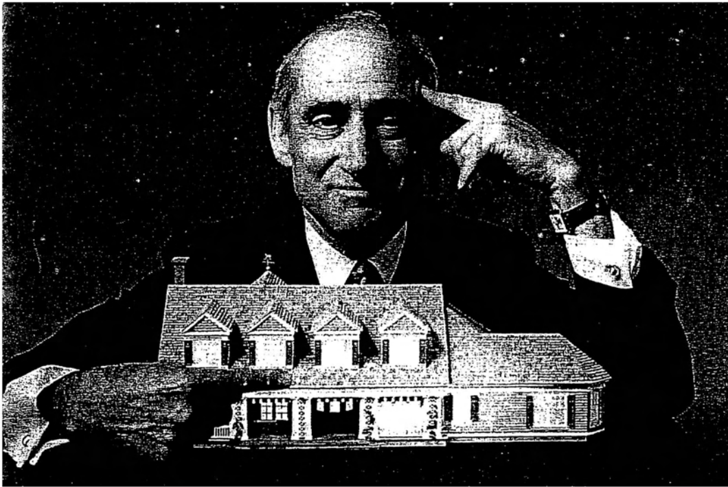
3. Photograph of Stern from Life Magazine , June 1994

can hardly believe our eyes. If this “completes” the disguise, where did it begin? Is Stern teaching us the language of American cheerfulness or the language of deception?