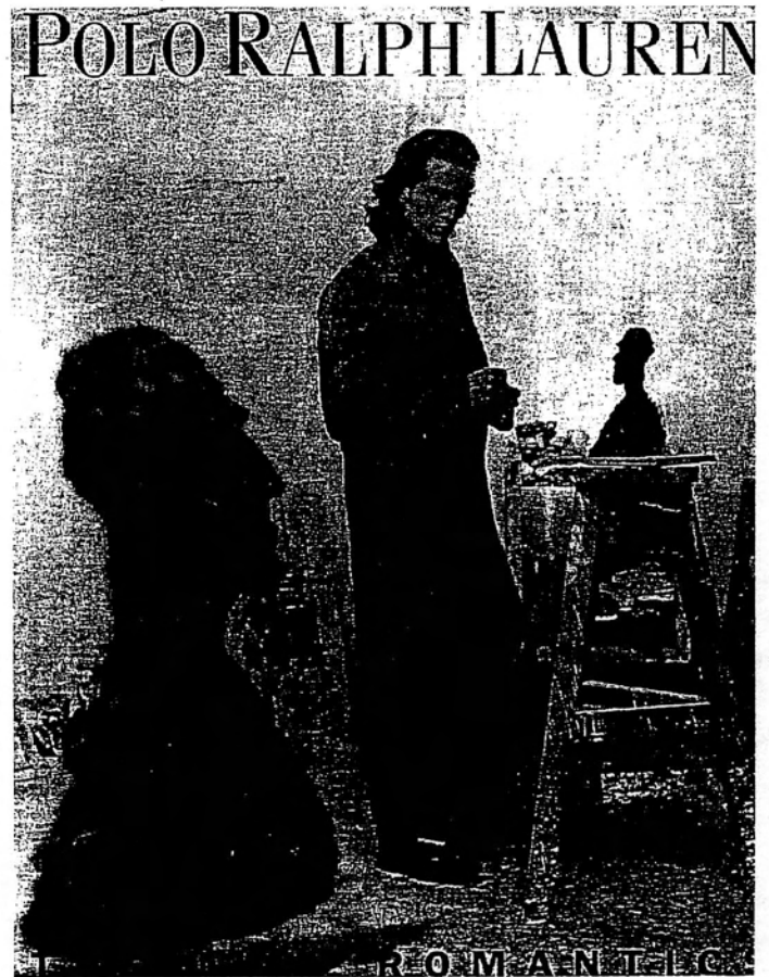
4. Polo Ralph Lauren, “The New Romantics”

The interplay of high aesthetics with aesthetic cunning, and of authenticity with bourgeois self-righteousness, was brilliantly parodied in a recent advertisement for Ralph Lauren Polo, and it is here that I wish to end my ramblings. The image portrays an artist in his studio. But we notice right away that the work of art he is fashioning very closely resembles a Giacometti. This artist is clearly not an “original” thinker. He is an artiste, an imitator, and even worse, a fraud. But before we throw him and his work out the window, we might meditate on the interesting philosophical